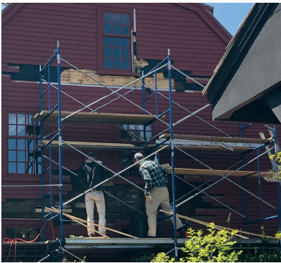
Members of our preservation team work to remove pockets of rot from the northeast wall girt.

The Nathaniel Hawthorne Birthplace is currently undergoing some carpentry repairs as water intrusions have rotted the end girt on the northeast wall. A tell-tale sign was the beginnings of a carpenter ant infestation. They love to nest in wood softened by water. Scaffolding is currently up to conduct explorations and make repairs. As clapboards were peeled back, a significant amount of rot was discovered on the end girt (beam) between the first and second floors of the eastern elevation. Fortunately, the rot and ant infestations were discovered before the structure was wholly compromised, and a minimally intrusive approach can be taken to repair the rotted posts and studs that were resting on the girt.