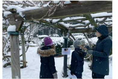
A sweet scavenger hunt through the snow during the Salems So Sweet festival.

While 2022 will see much of this programming return to in-person, we are glad to have had the opportunity to reach beyond our local community with these programs. We look forward to engaging a variety of audiences with new opportunities.