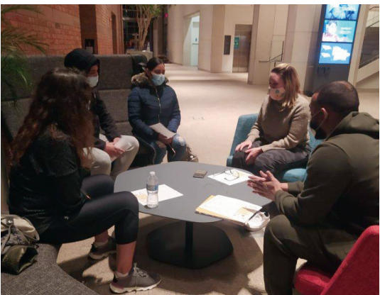
Community volunteers and ESL students participate in our conversation circles program.