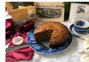
A colonial molasses cake recipe cooked live on zoom in our café kitchen in December 2021 for our Colonial Classics program.

Like so many institutions, The Gables pivoted many of its programs from in-person to virtual in 2020. In 2021, we continued many of these virtual programs, including Colonial Classics (historic recipes made and shared by staff), Ancestral Bingo for Salem Ancestry Days, virtual tours for the Council on Aging, lectures such as “The Monopolist” and the sold-out “Salem as Inspiration,” an online book club, and the introduction of Instagram Live and the podcast, “The Many Myths of Miss Emmerton.” Additionally, we added two self-guided audio tours – “Passages of the Past” and “Hawthorne’s Shadow”- for visitors to download, and an immersive 360 virtual tour of the Turner-Ingersoll Mansion. We also hosted virtual field trips with students from around the United States by providing them with a virtual tour and virtual versions of our “Naumkeag Settlers to Salem Shippers” education programs.